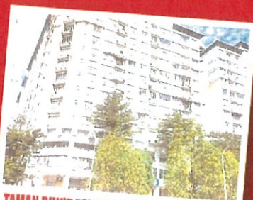
TAMAN BUKIT PELANGI, SUBANG JAYA 1,001 sq ft - RM165,500