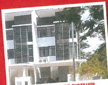
CRISTAL SERIN RESIDENCE, CYBERJAYA 2,562 sq ft - RM1,080,000