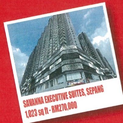
SAVANNA EXECUTIVE SUITES, SEPANG 1,023 sq ft - RM270,000

PROSPECTIVE BIDDERS MAY SUBMIT THEIR BIDS FOR THE PROPERTY ONLINE AT WWW.LEONGAUCTIONEER.COM ("AUCTIONEER'S WEBSITE")