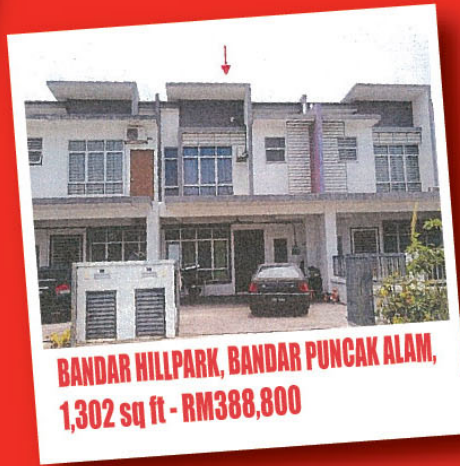
BANDAR HILLPARK, BANDAR PUNCAK ALAM, 1,302 sq ft - RM388,800