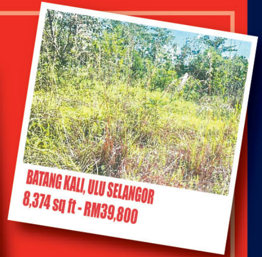
BATANG KALI, ULU SELANGOR 8,374 sq ft - RM39,800